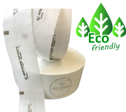
ECO RESIST ROLL TRANSFER