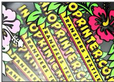
A3 TRANSFER (420 x 297 mm)